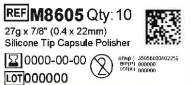
LBL0008 – Sterile boxes of 10