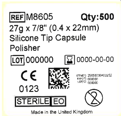
LBL0020 – Sterile bulk