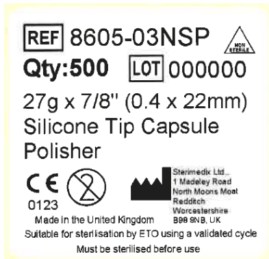
LBL0012 – Non-Sterile bulk