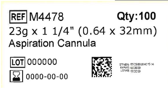
LBL0024 – Sterile boxes of 100