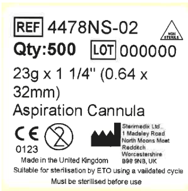
LBL0012 – Non-Sterile bulk