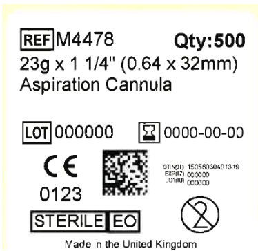
LBL0020 – Sterile bulk