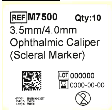
LBL00009 – Sterile boxes of 10