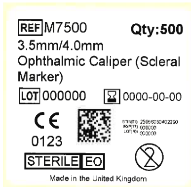
LBL00020 – Sterile bulk