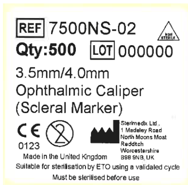
LBL00012 – Non-Sterile blister bulk